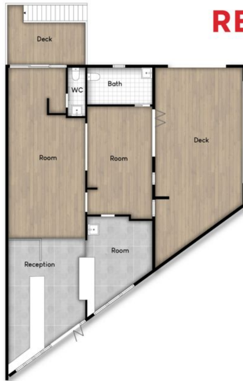
Ground Floor Tenancy